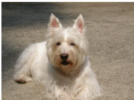
Stop by the shop and visit "Bonny" the shop dog.

If you would like to submit photos for inclusion in future Birds & Butterflies Newsletters please send email them to webmaster@geopolus.com . Please include a short description of the photo and your name. We can't promise to use all of them but we will try.