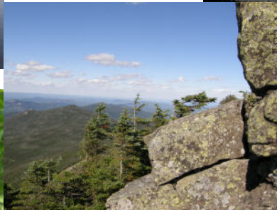
Top of White Face Mountain